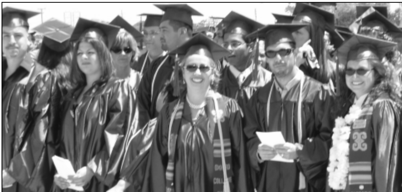
Oxnard College 2004 Graduation Student Speakers

Oxnard College offers courses, designated degrees and certificates, and license/permit preparation as indicated in the chart on the following page.